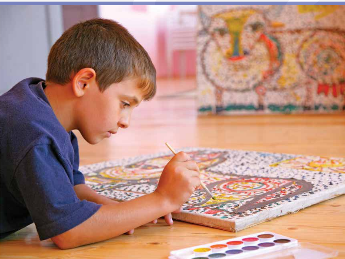
A boy who previously lived on the streets paints at the UmidYeri ('Place of Hope') Children's Shelter and Rehabilitation Centre in Baku, Azerbaijan.

Around the world, innovators are trying out unconventional approaches to education – like using simple toys to illustrate principles of science, or setting up innovation labs to give children a space in which to tinker with models and machines. Such initiatives impart critical knowledge and skills, while giving children opportunities to build their confidence as thinkers, makers and problem solvers. These experiences can change children's lives – and children, in turn, have the potential to change the world.