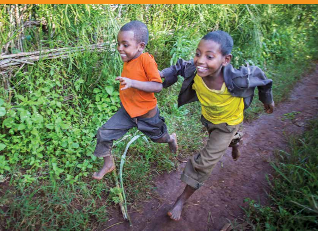
Children play near the Kitmbile Health Post in Oromia State, Ethiopia.

A range of initiatives are supporting innovation that benefits the poorest children and families. Prominent thinkers are devising new incentives for drug manufacturers to develop treatments for child killers like tuberculosis, which disproportionately affect people who can't pay high prices. Open source product development and copyright exceptions are breaking down intellectual property restrictions to build a new system that promotes collaboration and adaptation and expands access to information and technologies. Partnerships that combine businesses' technical capacities, resources and distribution networks with the development community's knowledge and experience are creating new markets geared towards the needs of underserved communities. Synergies between public and private, global and local are helping to boost the impact of local innovations and surmount the obstacles that bar the poorest children from realizing their rights.