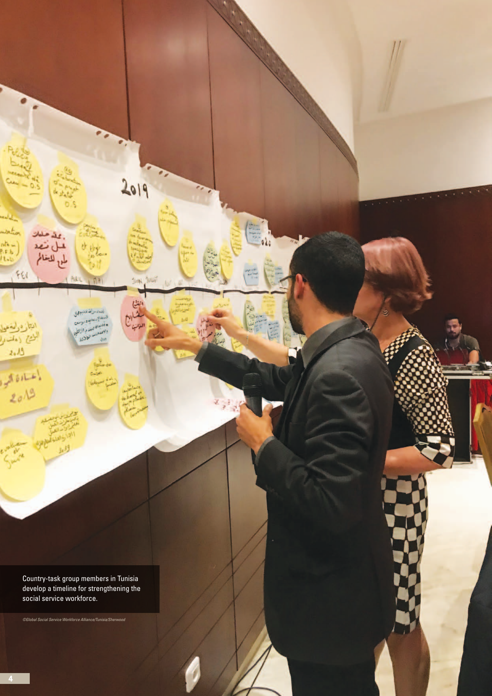
Country-task group members in Tunisia develop a timeline for strengthening the social service workforce.