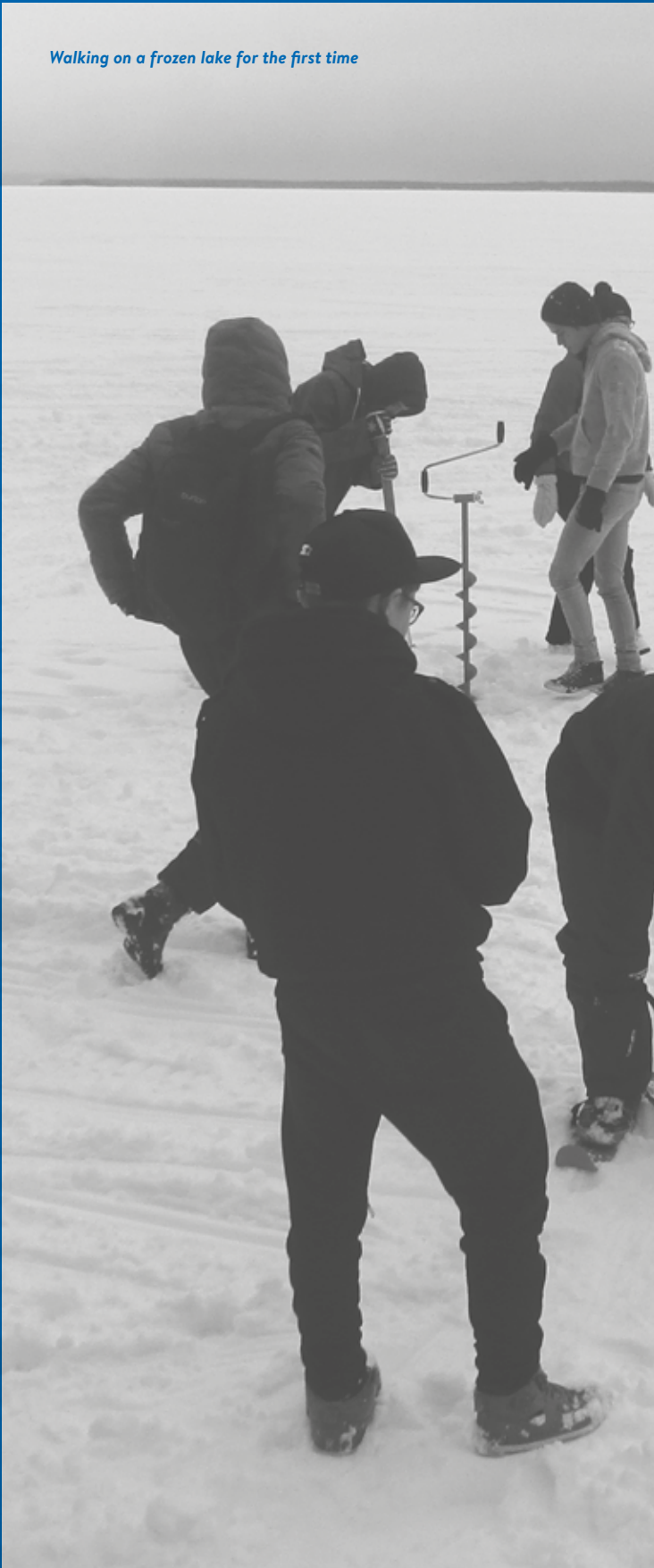
Walking on a frozen lake for the first time