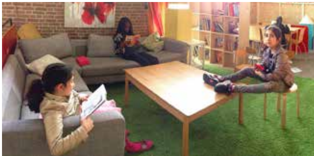
↑ Children enjoying the central living room in the Nest centre in Katwijk.