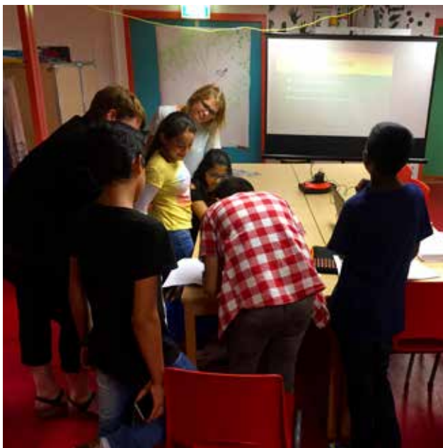
↓ Boys and girls of the Child Research Group in the Nest centre in Burgum.