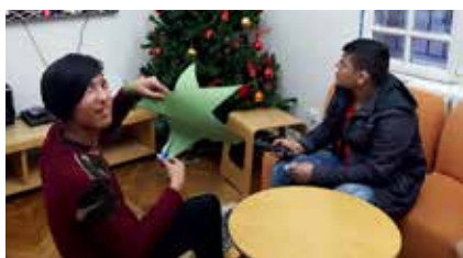
↑ Preparing for 1st Christmas in Athens, Greece