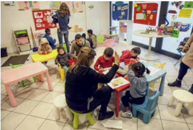
↑ Child-friendly space