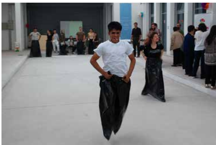
↓ Sack race – We clearly have a winner!