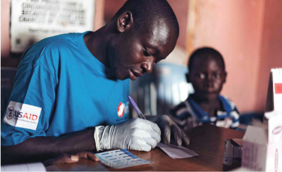
HIV testing being conducted in East Central Uganda.

appetite to increase wage spending by the government at the time of the analysis.