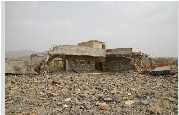
Al-Muzat School in Hajjah Governorate

bombardments and ground attacks has also resulted in parents often choosing to keep their children at home.