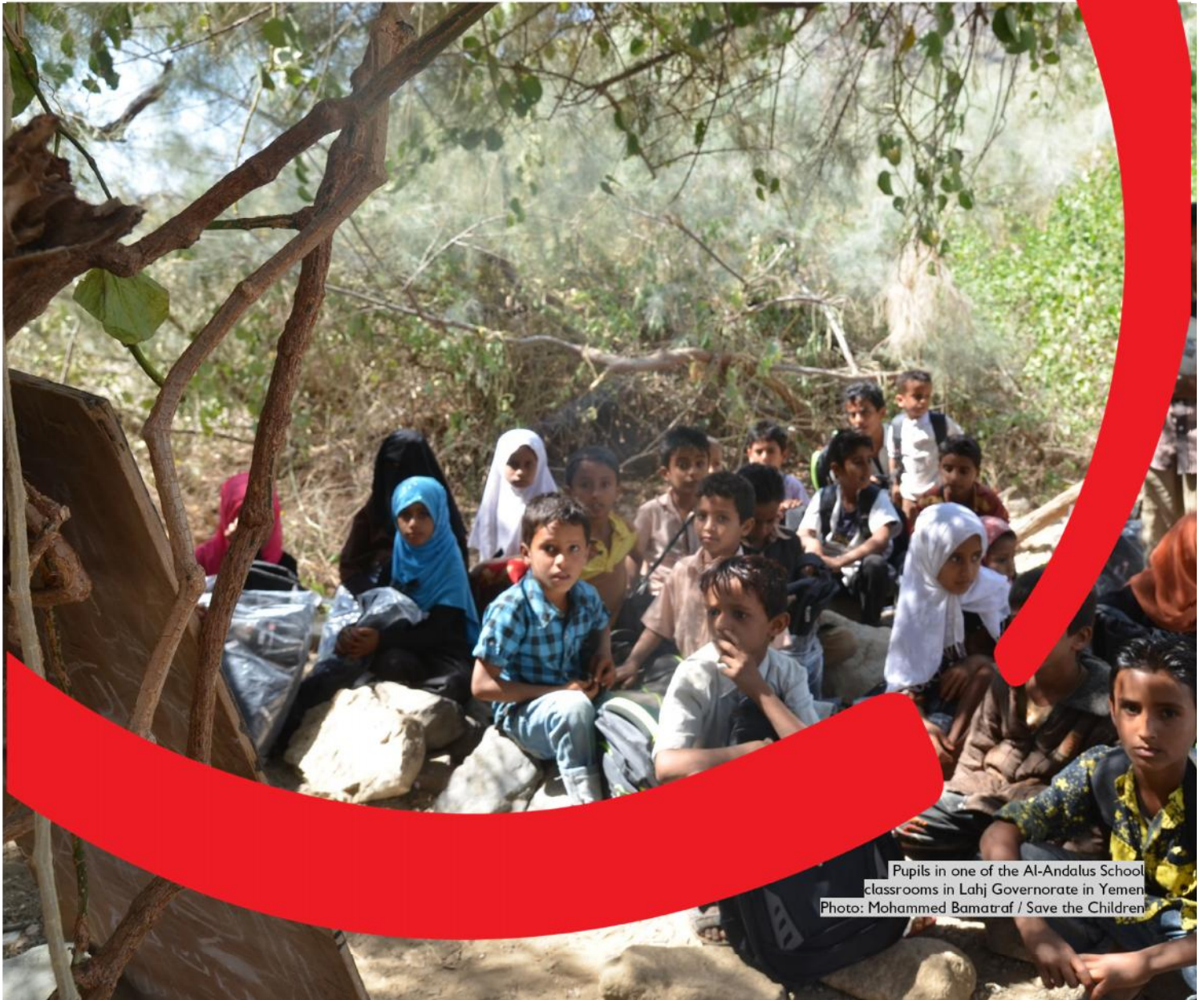
Pupils in one of the Al-Andalus School classrooms in Lahj Governorate in Yemen