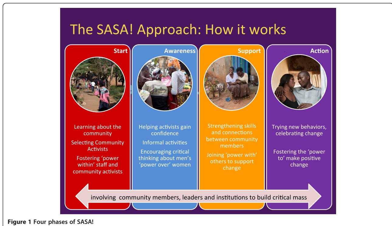
Figure 1 Four phases of SASA!

The study employed a cluster-randomized design, with randomization carried out within matched pairs. Full details of study design are presented in the SASA! Study protocol [23]. Briefly, eight 'sites' eligible for delivery of the intervention (each comprising one or two administrative Parishes) were identified on the basis of operational and programmatic considerations. All sites were separated from each other by a geographical buffer (at least one parish wide) to reduce the potential for intervention diffusion into control sites. Sites were matched into four pairs on the basis of qualitative assessments by CEDOVIP staff as to whether the site was urban or peri-urban, and the stability/mobility of the local population. Randomization