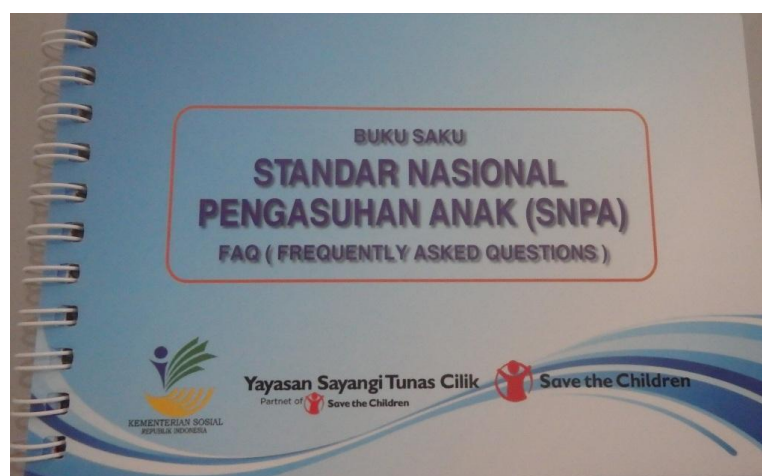
Pocket book of National Standards of Care