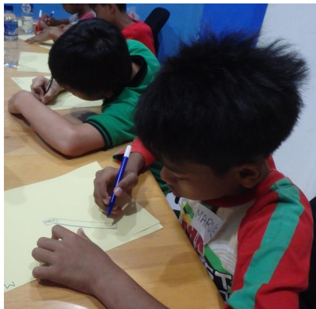
Consultation with children

Increased efforts are need to identify, understand and build upon traditional beliefs and practices which support the care and protection of children in families, including increased understanding of informal kinship care and informal adoption.