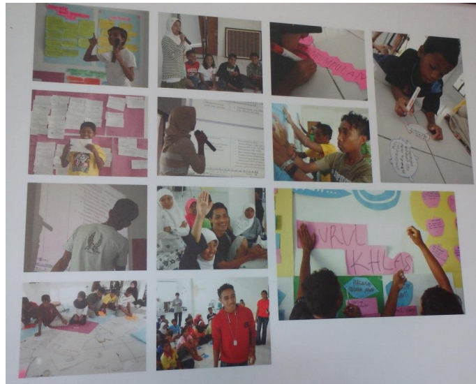
Child led research supported by Save the Children 2007 to 2008

on care, and piloting of the National Standards of Care to ensure gatekeeping and increased care of children in families.