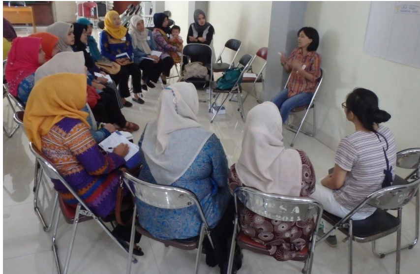
Discussions with local cadre about informal care