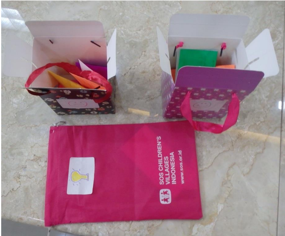
Happy box, worry box and suggestion bag with children's views from a consultation with children

Analysis: Transcripts were made from each interview and focus group discussion. Nvivo 11 was used to code and identify emerging themes, thus enabling more systematic analysis.