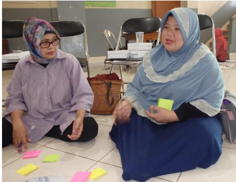
Focus group discussion with mothers