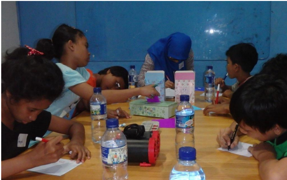
Consultation with children

to raise their concerns, to receive counselling and to refer children to relevant services.