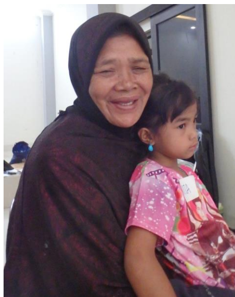
Grandmother caring for granddaughter

Informal kinship care is widespread, unregulated and largely unsupported. Informal kinship care is common practice and is usually the first option for children who cannot live with their parents. Data on children under 15 years of age was extracted from a national population survey in 2000 (Population Modul Survey (MK), 2000); see Save the Children, DEPSOS RI and UNICEF, 2007, p.22-23). There were 60 million children under 15 years in Indonesia living in households within their communities. Over 2.15 million children were not living with either parent, although 72.5% of these children had both parents alive, 15.5% had lost one parent, and only 10.1% had lost both parents. The situation of the parents was unknown for 1.9% of children. Thus, significant numbers of children under 15 years of age are being cared for by families (that do not include their own parents). 58.6% of these children were living with grandparents and 29.3% with other relatives. Therefore almost 88% of children not cared for by parents are living in kinship care. The fact that over 6.5 million children under 15 are either living in single parent families or within extended families reflect the strong recognition in Indonesia of the role and responsibility of families, including the extended family for the care of children (see Save the Children, DEPSOS RI and UNICEF, 2007, p.22-23).