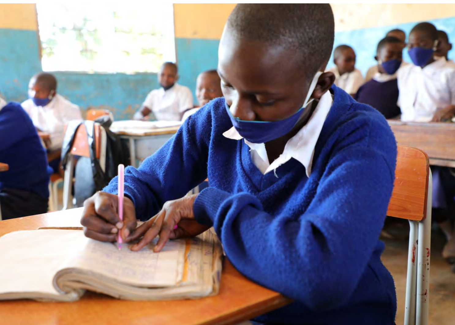
Schools in Tanzania were closed for over 100 days as part of COVID-19 control and prevention measures

Based on the views and experiences shared by children and young people in these consultations, World Vision recommends that the relevant actors work together to provide practical help in the areas of education, health and hygiene, food provision, family livelihoods and COVID-19 awareness raising. Participants' responses highlight the need to establish and maintain comprehensive child protection mechanisms and provide clear avenues to seek support. Relevant stakeholders and decision makers must also listen to children and young people and consider their views when planning COVID-19 response strategies.